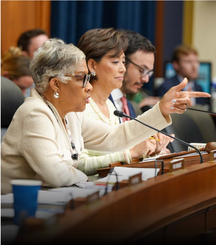
Beatty leads a discussion as a subcommittee Ranking Member of the powerful Financial Services Committee where she engages national witnesses in hearings on financial policies and proposed laws.

Congresswoman Joyce Beatty stands as a leader and advocate on the House Financial Services Committee, where key decisions shaping U.S. fiscal policy and banking regulations are made. As Ranking Member of the Subcommittee on National Security, Illicit Finance, and International Financial Institutions, Beatty is committed to deterring financial crime and bolstering the global financial system.