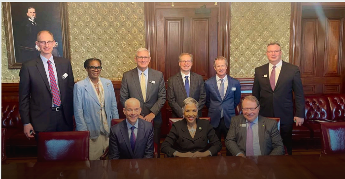
Congresswoman Beatty and the Columbus Partnership delegation at the White House.

Use this web address: https://bit.ly/JBBDEI