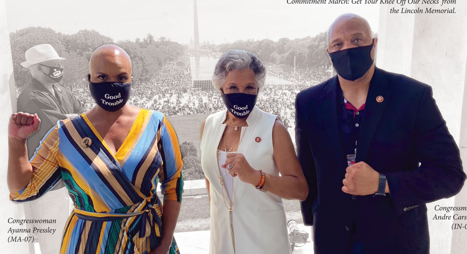
Congresswoman Ayanna Pressley (MA-07)

Congresswoman Beatty addresses the nation during the 'Commitment March: Get Your Knee Off Our Necks' from the Lincoln Memorial.